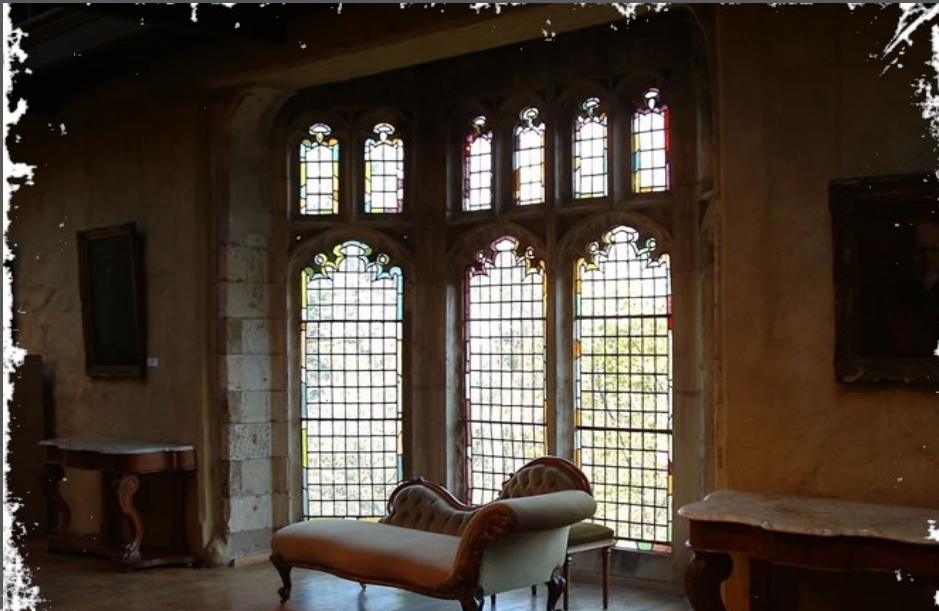
THE UPPER GALLERY LEADLIGHT WINDOW