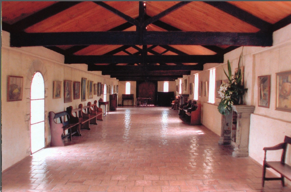
THE LONG GALLERY / BY THE ORNAMENTAL POND