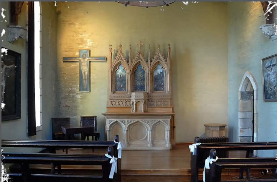
INSIDE THE BLUESTONE CHAPEL