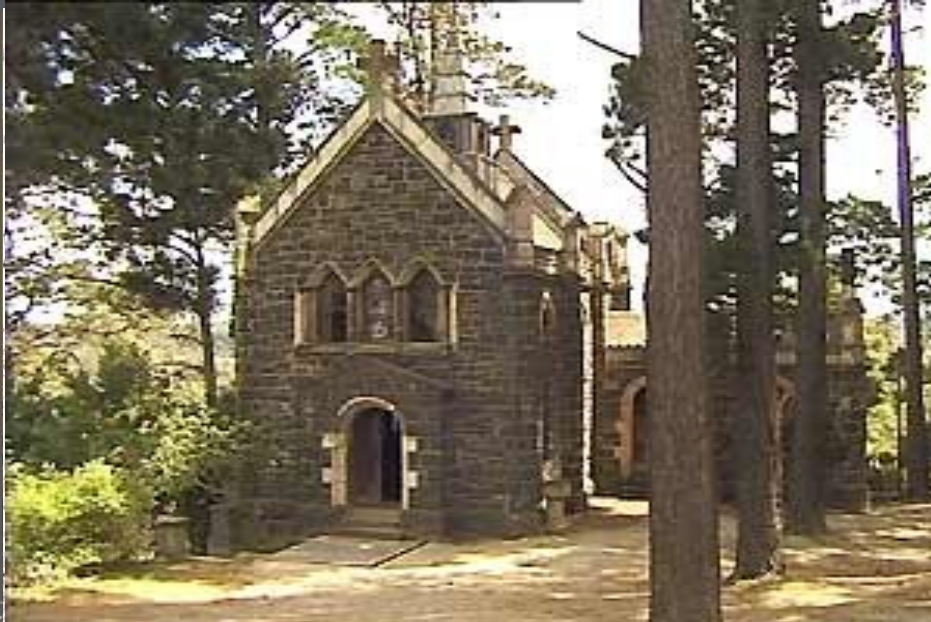
THE BLUESTONE CHAPEL