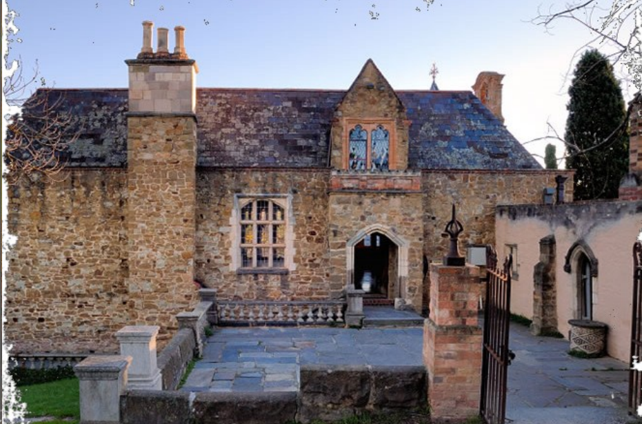
THE UPPER GALLERY ENTRANCE & COURTYARD