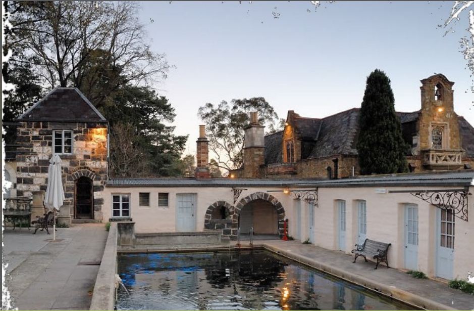
THE ORNAMENTAL POND