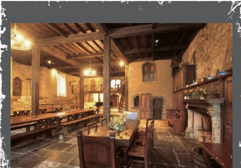
INSIDE THE GREAT HALL